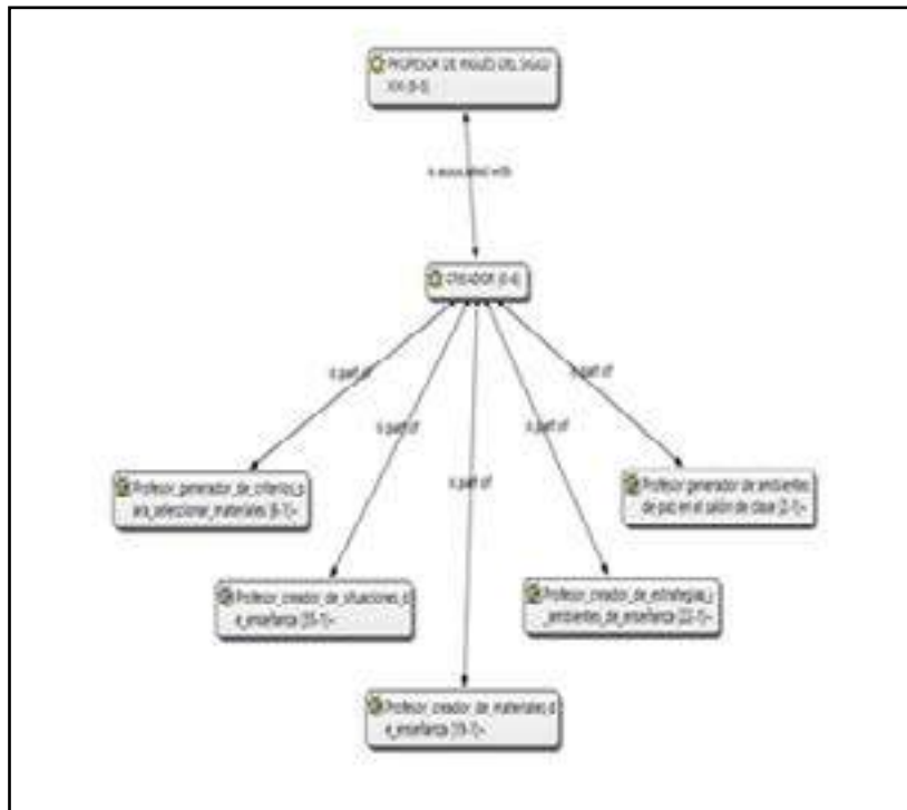
Figure 2. Creative English teacher.

Reviewing this information, it was reiterated that Preservice English teachers must become the creators of the learning environment, thereby leading to a transformation of the educational environment so that they can implement other teaching strategies.