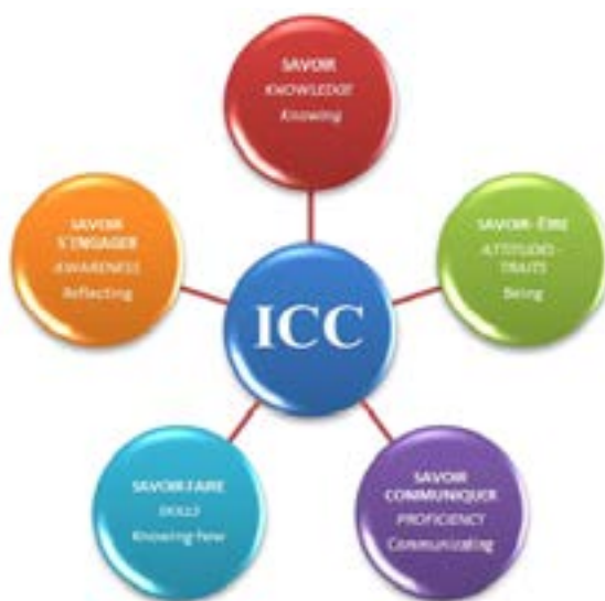
Figure 1. The dimensions of ICC

Note. This graph represents the five knowledge or dimensions of the ICC. Rico Troncoso, 2012 quoted by Mesa-Hoyos et al, 2019 (p.10).