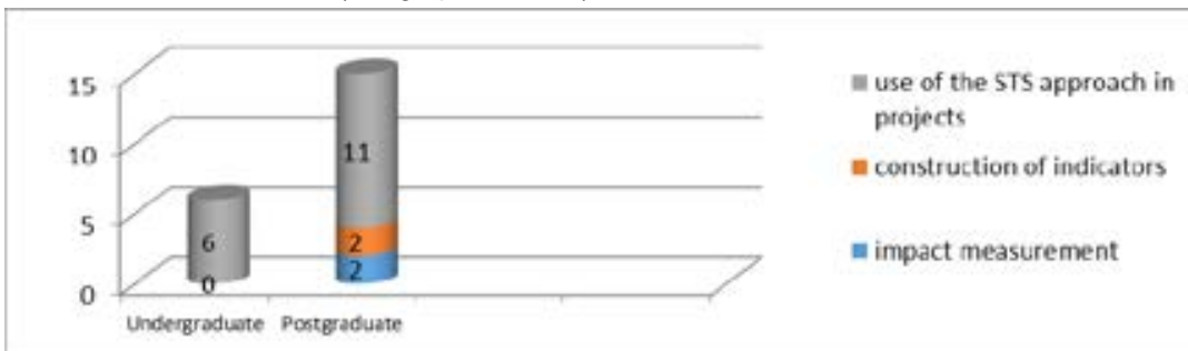
Graph 1.1 Previous knowledge received by MTCP project managers on the subject (source: own elaboration).

The previous training of project managers (undergraduate and graduate studies received on the topics does not include work with the topics related to social impact measurement, which contributes to the fact that their mastery and skills in the contents related to social impact measurement are deficient (see graphs 1.1, 1.2).