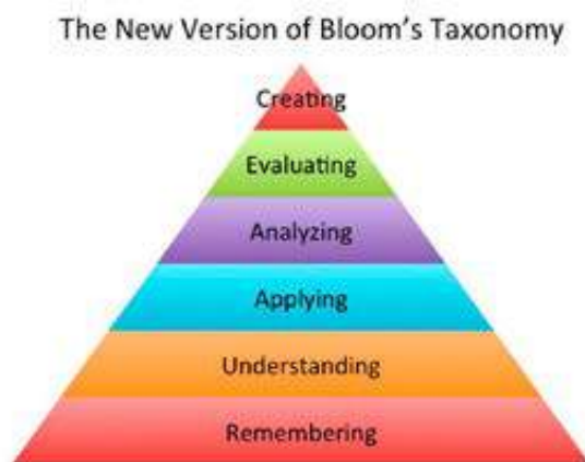
GRAPH 1: Revised Bloom's Taxonomy

The hierarchy in Bloom's taxonomy is divided into different levels with keywords which are focused on critical thinking levels such as: Creating, Evaluating, Analyzing, Applying, Understanding and Remembering as the graphic shows: